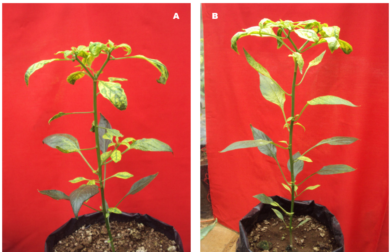
Fig. 1. Symptoms of PYLCIV infection on var. Luwes (A) and var. Biola (B).

Most plants infected by PYLCIV showed obvious symptoms of yellow mosaic, leaf curling and stunting (Fig. 1). Disease incidence reached 100 % in all treatments, although severity of the symptom varied among treatments. In general, the disease symptom on var. 'Biola' was more severe than those on var. 'Luwes'. However, the number of plants showing most severe symptoms (score 5) was found higher on var. 'Luwes' (Table 1). Disease symptom was developed faster on var. 'Luwes' than on var. 'Biola'. Delay symptom development was observed when Fusarium sp. isolate AC-2.7 and Curvularia sp. isolate H12 were applied (Table 2, Fig. 2). However, there were no significant differences on incubation period of the disease based on statistical analysis. It indicated that symptom development was affected either by plant varieties or endophytic fungi (Table 2).