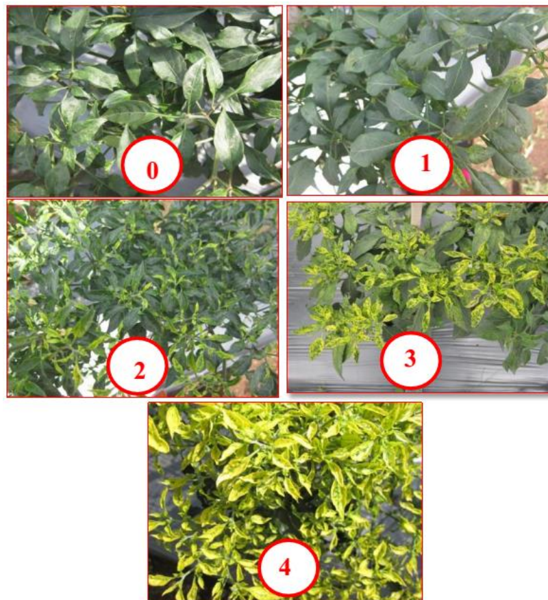
Figure 1. Scoring of disease symptom: 0 = no symptom (healthy); 1 = mild mosaic; 2 = mosaic, yellowing contrast; 3 = mosaic, yellowing contrast, leaf malformation, 4 = acute mosaic, yellowing contrast, leaf malformation

Some parameters were observed from M 1 and M 2 population. In M 1 population, parameters observed were seeds germination, seedling height, percentage of abnormal seedlings, chimera and male sterility phenomena, LD 50 point, plant height at flowering stage, fruit length, fruit diameter, weight per one fruit, and fruit numbers per plant. Meanwhile, parameters observed in M 2 population were the coefficient variance genetic (CVG), heritability ( h^2_{bs} ), disease symptoms (scoring) and incubation time as resistance parameter to Begomovirus and also some other agronomical traits. Scoring of disease symptoms was shown Figure 1. All data were initially analyzed by using F test and any significant result was further tested by using the DMRT (Duncan Multiple Range Test) at 5% significance level.