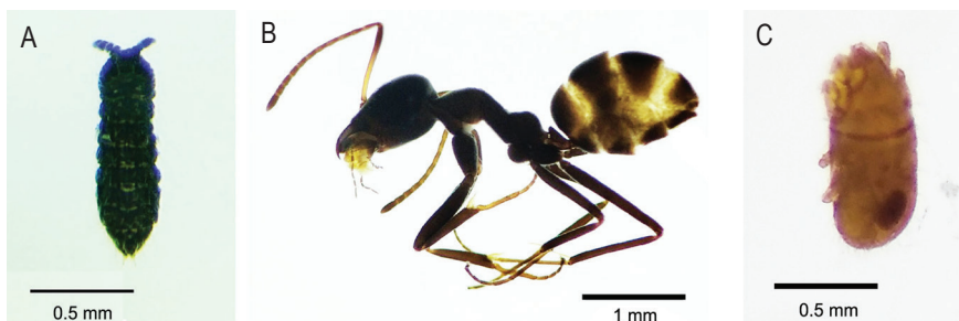
Fig. 1. The most abundant arthropods that recorded from the topsoil of soybean field in Malang: (a) collembolan ( Ceratophysella sp), (b) ants ( Iridomyrmex sp), and (c) mites ( Lohmanniidae sp)